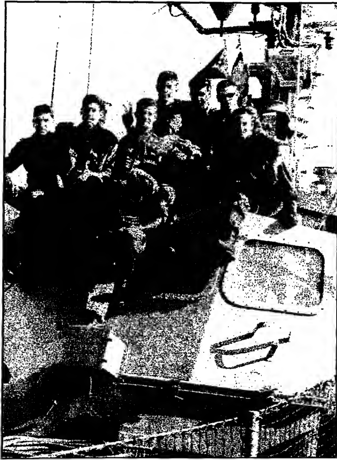
Crew members of the Dvora-class patrol boat pose yesterday in Haifa after their successful mission off Lebanon.

The documents provide horrifying early detail of the systematic campaign to destroy European Jewry and are expected to reopen the debate over when the Allied leaders first learned about the destruction of European Jewry. The documents are also liable to again raise questions about why so little